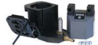
Easy to disassemble, for installation and servicing purposes