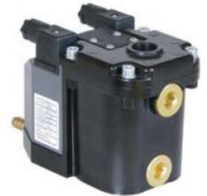
Multiple (3) inlet options