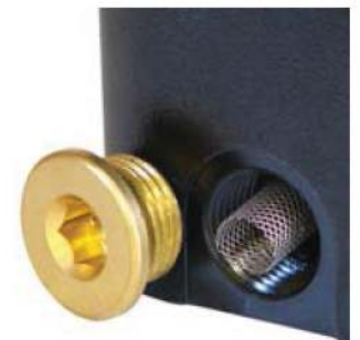
Integrated mesh strainer to protect the valve.

Alarm contact options Alarm Normally Closed (NC ) / Alarm Normally Open (NO)