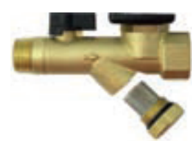
Integrated strainer with filter