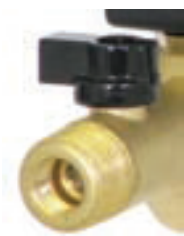
Dual inlet design

* For other requests/specifications please see FLUIDRAIN or EZ1 ranges.