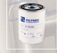
A1 LOW PRESSURE SPIN ON ELEMENT