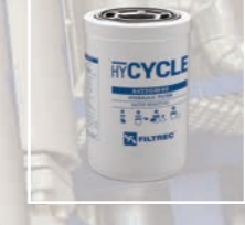
A4 HIGH PRESSURE SPIN ON ELEMENT