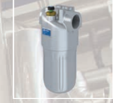
F100 IN LINE HIGH PRESSURE FILTER