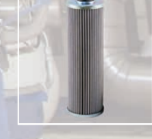
SPARE ELEMENTS SUITABLE FOR VARIOUS REFRIGERANTS AND OILS