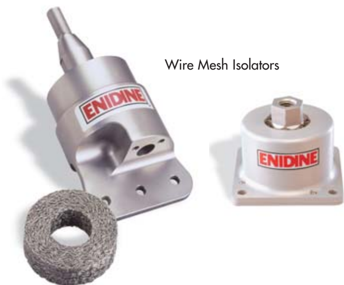
Wire Mesh Isolators

Wire mesh material can be manufactured in a multitude of shapes and sizes to accommodate your specific application. When exercised, the wire mesh damping elements convert input energy to heat. Friction is created when knitted or woven stainless steel wire strands are displaced relative to one another. Knitted metals have inherent resiliency and provide high-damping characteristics and non-linear spring rates.